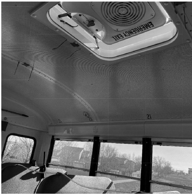
Figure 1. Photo of ceiling hatch fully opened, with the hatch fan on. Passenger windows are closed. A CO 2 probe attached to the back of the bench seat can be seen in the rear of the bus.

An outbreak of COVID-19 on a motorcoach bus was confirmed in Zhejiang province of China in January 2020 (Shen et al. 2020). This cohort study investigated COVID-19 infections in adult passengers riding in one of two similarly designed buses traveling to a worship event on the same day and route duration with the index patient. Passengers on the bus with the index patient reportedly had a 34.3% higher risk of getting COVID-19 than persons on the other bus, and all passengers, including the index patient, participated in the same worship event and ate at a luncheon at the destination. While exposure to SARS-CoV-2 was likely not limited to being on the bus (a luncheon and worship event occurred), the authors concluded airborne spread of SARS-CoV-2 in the enclosed, recirculated air environment of the bus with the index patient was the most likely explanation for the higher transmission rate among passengers on the same bus as the index patient.