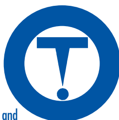
Class D-2 Poisonous and Infectious Material (material causing other toxic effects)