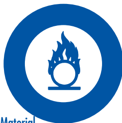
Class C Oxidizing Material