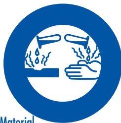
Class E Corrosive Material