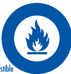
Class B Flammable and Combustible Material