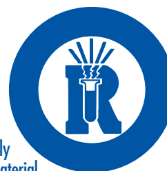
Class F Dangerously Reactive Material