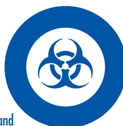
Class D-3 Poisonous and Infectious Material (Biohazardous Infectious Material)