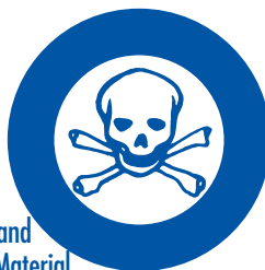
Class D-1 Poisonous and Infectious Material (material causing immediate and serious effects)